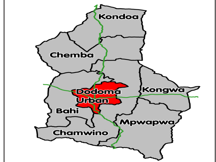
FIGURE 1: Map of Dodoma Region Showing the Study Area

Dodoma municipality is subdivided into 4 divisions (Urban, Hombolo, Kikombo and Zuzu Division) comprising of a total of 30 wards and 42 villages/streets. Dodoma Region lies in the eastern-central part of Tanzania and it is the capital city of the country. According to the 2012 national Census, the region had a population of 2,083,588 and population density of 50 people per square kilometres. It covers an area of 41,310 square kilometres (NBS, 2012). Female population accounts for 51.3% of the total population. The annual population growth rate is 2.1% with a sex ratio of 95 males to 100 females [NBS, 2012]. The region’s health care service structure comprise of 7 hospitals, 32 health centres, and 269 dispensaries, most of which provide reproductive and child health services. 19 The most dominant ethnic group is Gogo but other ethnics exist too such as Sandawe, Rangi Sukuma, Chagga. People of this area are involved in economic activities like business, livestock keeping, office work and farming. 21 figure 1 below.