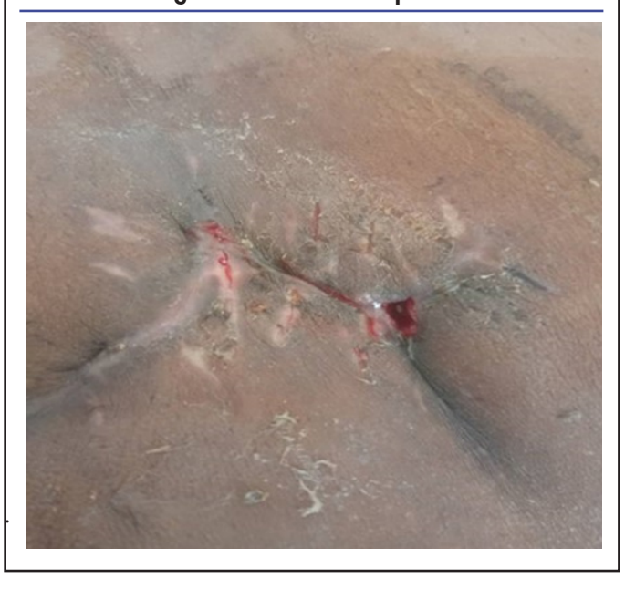
FIGURE 4: Surgical Site at Follow Up