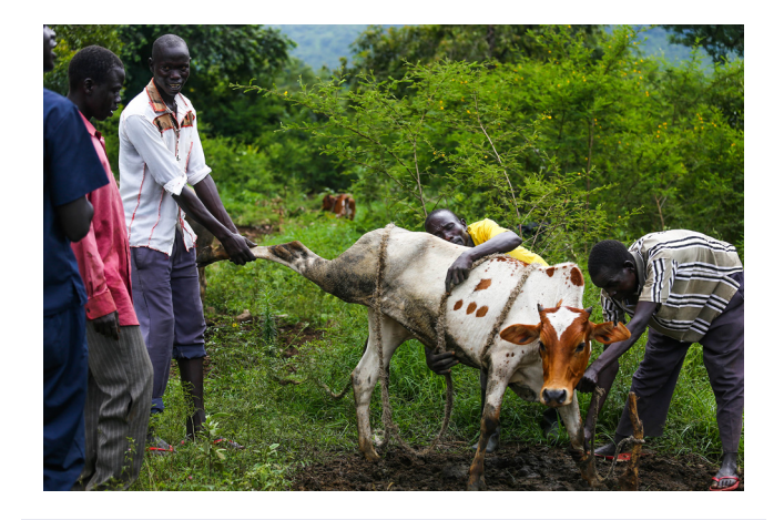
Livestock keepers preparing to cast a cow in Dufile Subcounty, Moyo District.

While the questionnaire was primarily comprised of questions that provided only coded check/tick box answers, several questions allowed text entry if the box for "other" was selected. For questions pertaining to delegation of livestock-associated tasks, respondents completed a table identifying tasks commonly performed, the household member usually performing that task (identified by gender and age), and the frequency that the task is performed within the household. With regards to injury variables, respondents were asked about their personal history of needlestick injury and animal-related injuries among household members and in the respective village. Animal injury was defined as any injury caused directly by an animal, such as a bite, kick, or gore, that occurred in the household within the past year.