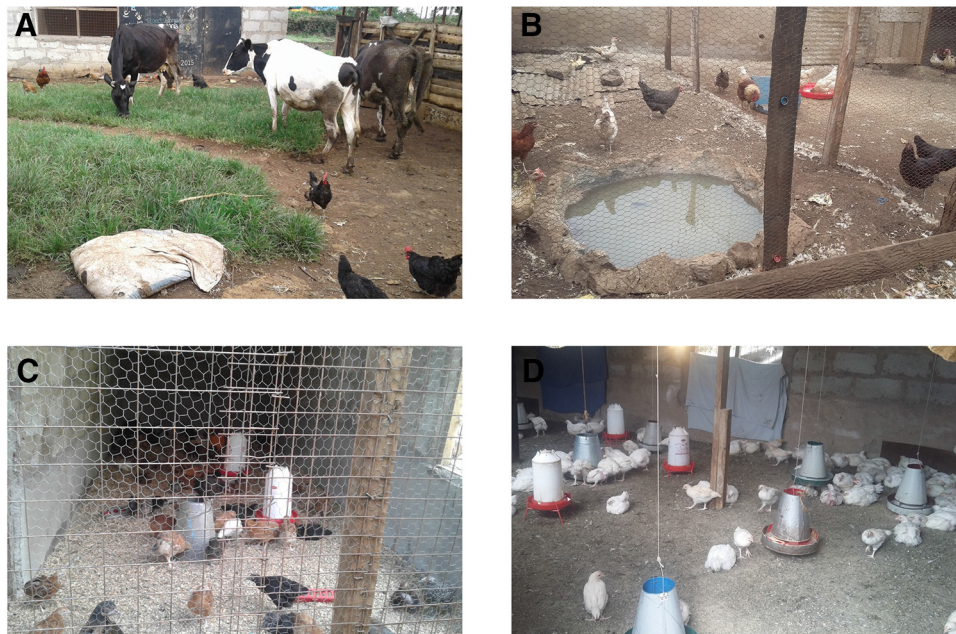
FIGURE 1. Examples of Poultry Production Systems at Different Levels of Intensification

(A) Extensive indigenous poultry production; (B) semi-intensive indigenous poultry production; (C) intensive indigenous poultry production; (D) broiler production